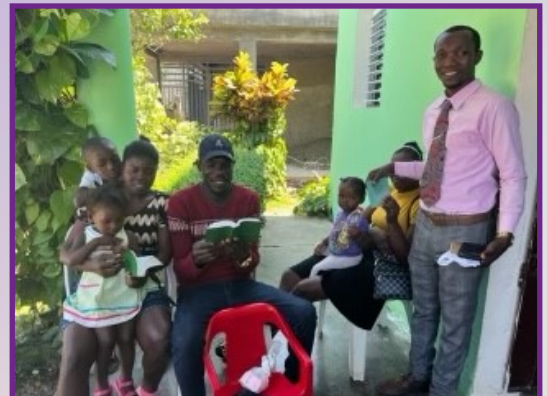
Haitians receiving New Testament Bibles in Creole language.

Under missionary designation, choose DR Schools, La Vega and Haitian. Check out our new Facebook page, teachfeedlove. Here's the link: https://www.facebook.com/profile.php?id=100087578141145 .